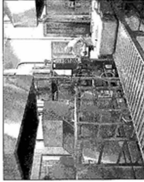
InSpec manages procurement and installation of manufacturing process equipment, including this food processing line

The Portland-based firm’s primary focus is on helping its customers design, build and operate manufacturing facilities and commercial spaces. Their group comprises a full range of architectural