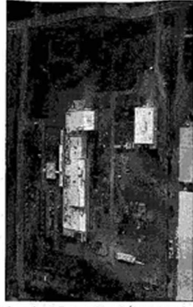
Expansion of Toray Composites (America) facility outside Tacoma, Washington

“Each company we work with has a vision of having a business up and running and we bring that vision to life. We help in all facets and even find time to assist with small things outside of work on behalf of our customer’s employees who may have never worked overseas before. We have, and we